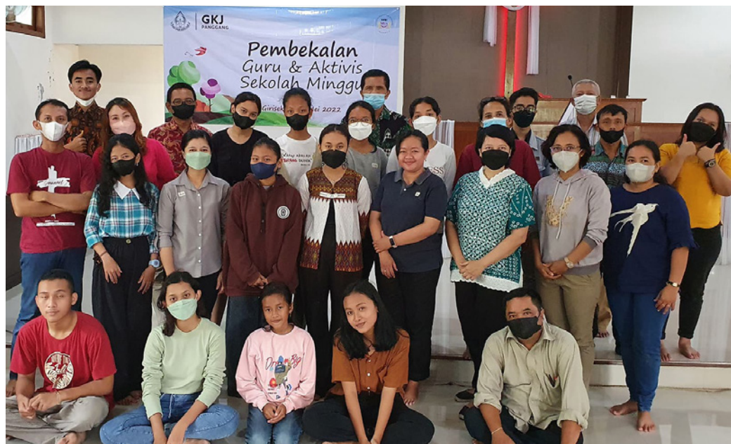
Sunday school teacher training at Gunungkidul-Yogyakarta

Half the Indonesians live on Java Island. Javanese language dominates, the sec-